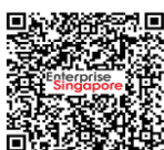
(1) Enterprise Singapore