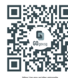
(3) SkillsFuture Singapore's SFEC Microsite