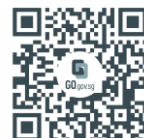
(3) SkillsFuture Singapore's SFEC Microsite