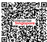
(1) Enterprise Singapore